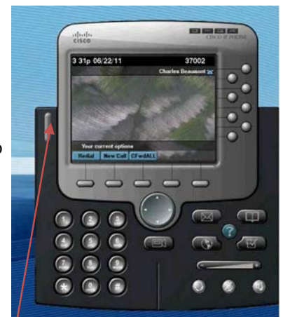
When message is opened anywhere, MWI light turns off.